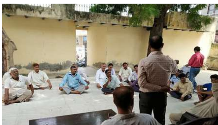
Figure 1: Glimpse of Activities under PKVY project across states